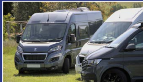
AUTO · EXPLORE